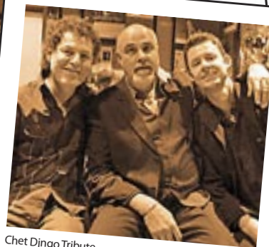
Chet Django Tribute