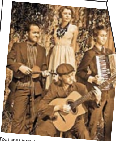
Fox Lane Quartet

Festivals dedicated to jazz manouche are held around the world, the most notable being the Samois Festival du Django Reinhardt in France. Across Australia there are many musicians and fans of this music, so it's time to have our own jazz manouche festival, and bring us all together!