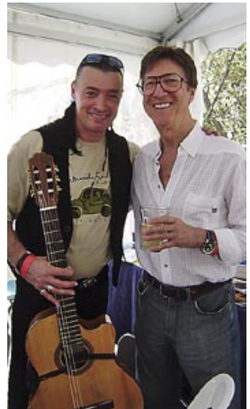
Lulo Reinhardt and Hank Marvin